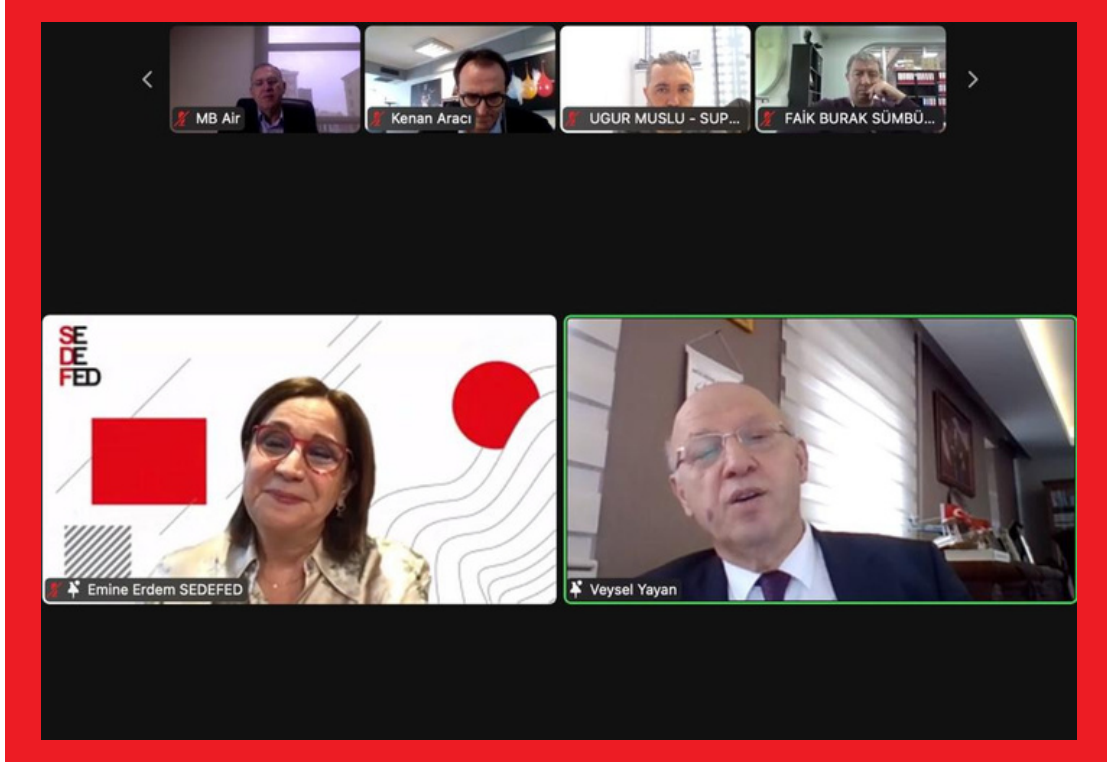
05.04.2022- Global Commerce Talks 4 - Steel Industry

SEDEFED also continues to implement "Global Commerce Talks" project, in which it hosts representatives from different sectors in each webinar to discuss the developments in the global economy ranging from "raw material to supply chain, from commodity prices to energy costs" and their reflections on our country.